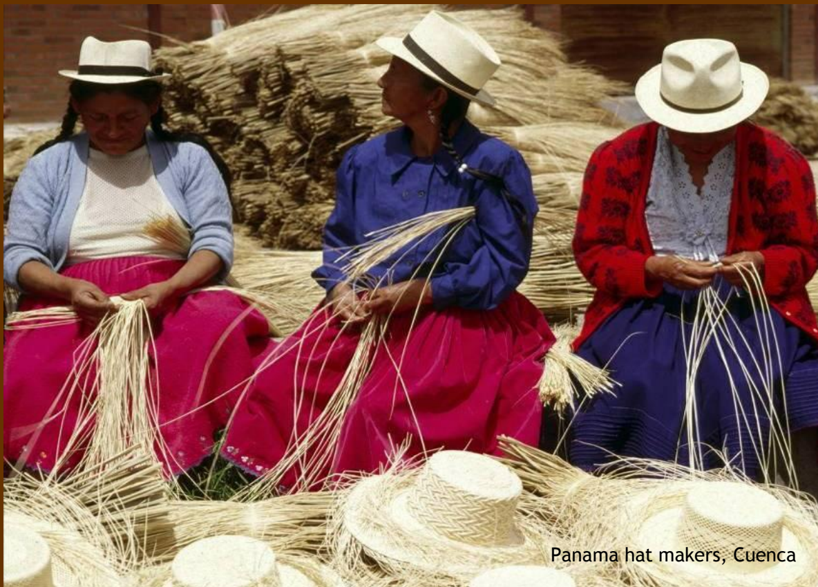
Panama hat makers, Cuenca