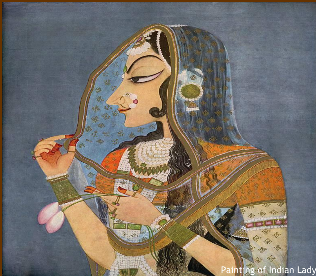
Painting of Indian Lady