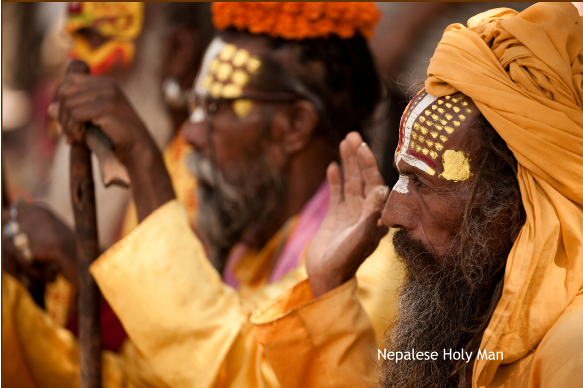
Nepalese Holy Man