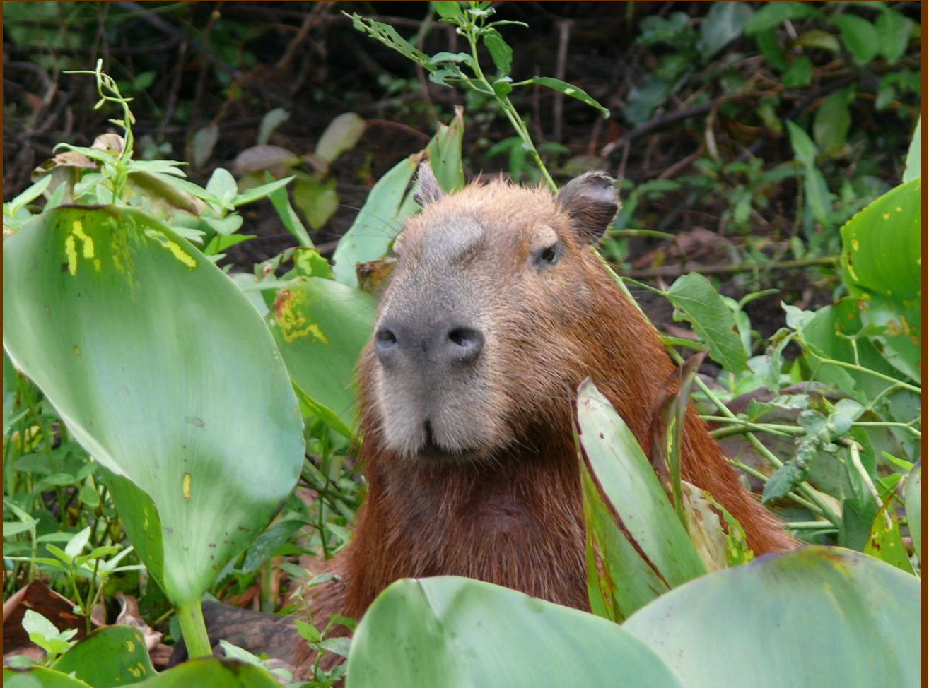
Capybara in the Pantanal