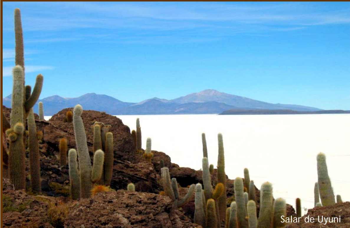
Salar de Uyuni