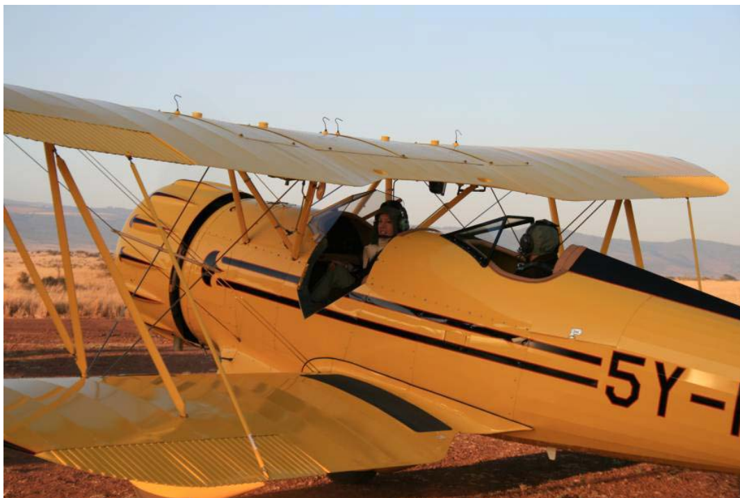
Bi-plane at Lewa!

Depart Nairobi on the Kenya Airways flight to Heathrow, flying overnight on KQ 102, departing at 23:45.