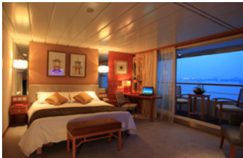
Deluxe cabin on Yangzi Explorer ship

The following cruise programme is used by Victoria Cruises. A similar programme is also followed by the Yangzi Explorer.