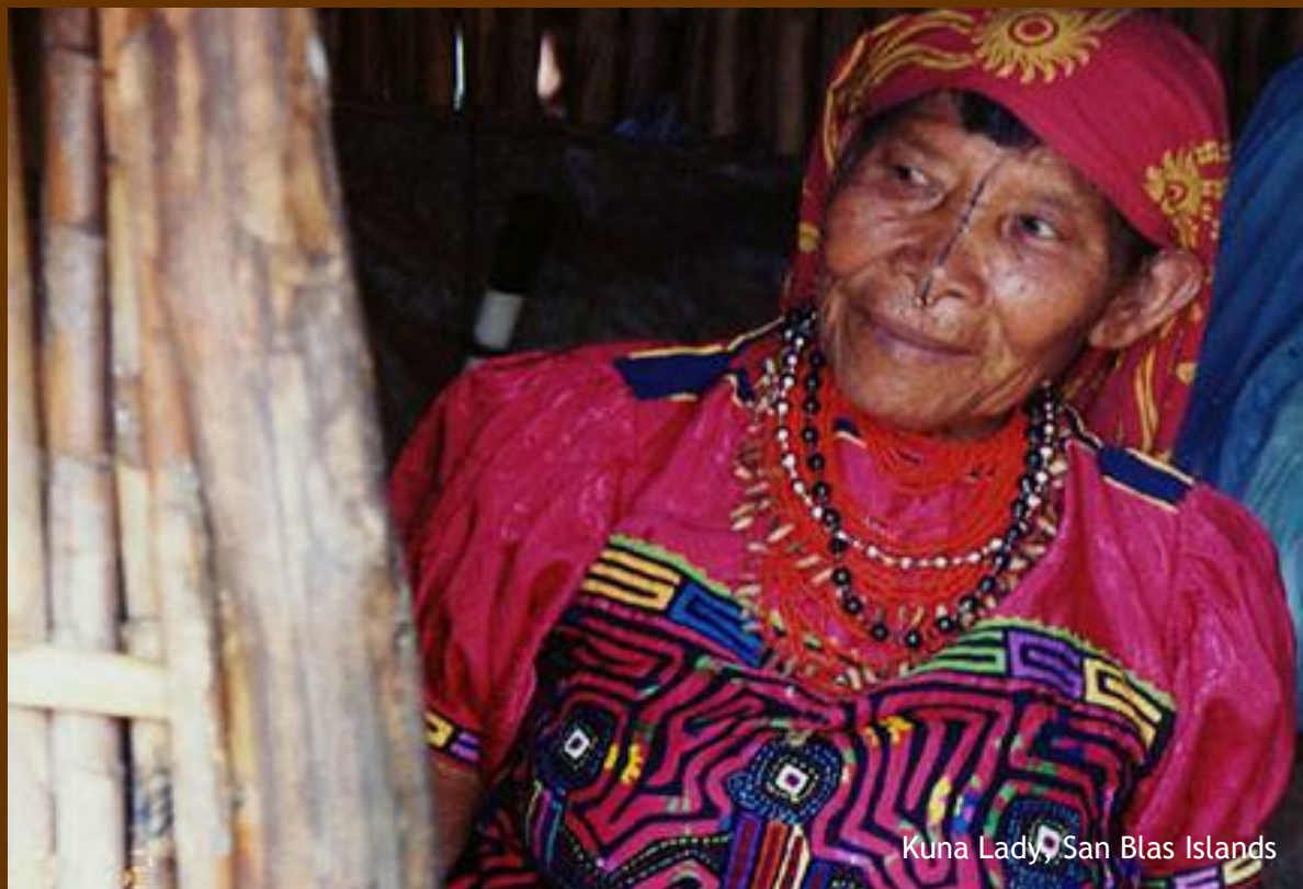
Kuna Lady, San Blas Islands